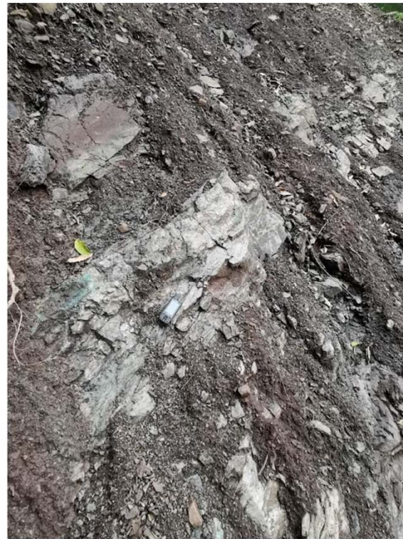
Photo channel "B" . The albitized shale dips 30 deg to the west. See GPS (20cm) at the center of the image for scale.