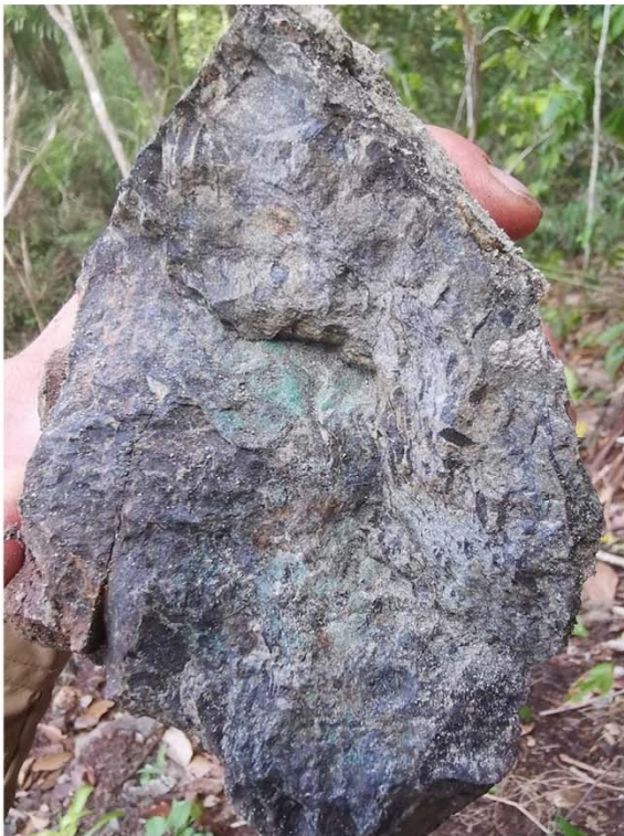
Photo from channel "A" . The sample is characterized by bedding parallel disseminated copper sulphide (chalcocite \text{Cu}_2\text{S} ), in an albitized organic shale host rock.

Photo of the mineralized outcrop reported here. Both zones are partially sampled and assay results from the full zone are pending. The outcrop was discovered in a recent landslide and have previously been covered by a thin soil layer. Distance from A to B is 10 meters and the total length of the exposed zone is >30 meters.