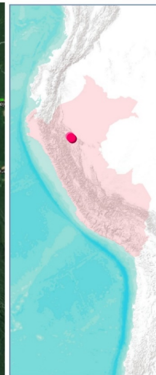
Location of the San Martin Project in Peru